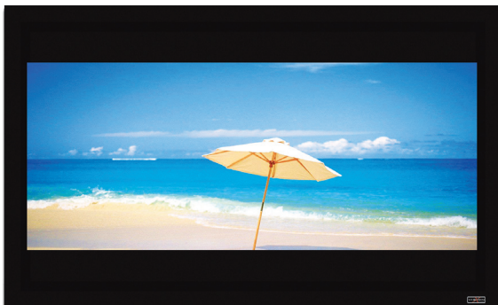
CinemaScope™ Widescreen 2.35:1

CinemaScope™ Widescreen (2.40:1) : 86"-143"