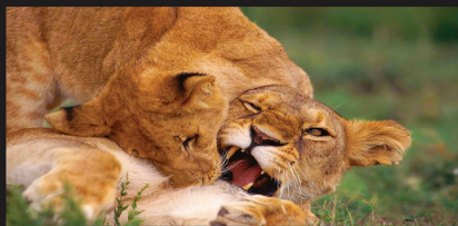
CinemaScope™ Widescreen 2.35:1