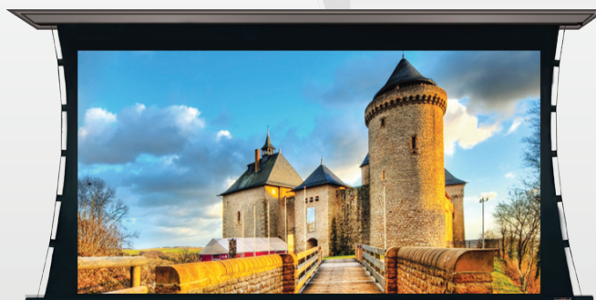
CinemaScope™ Widescreen 2.35:1